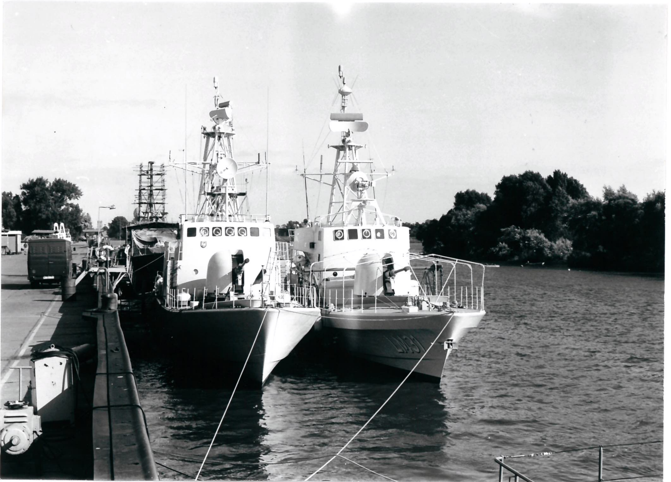
links Typ 148, rechts NB.435 für Ecuador