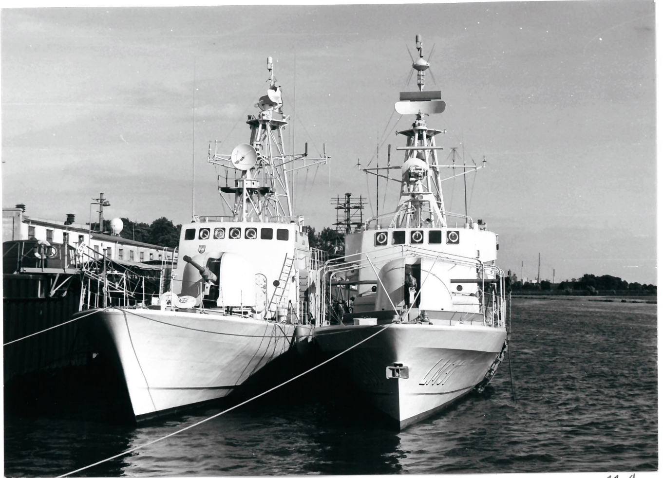
Typ 148 TNC 45