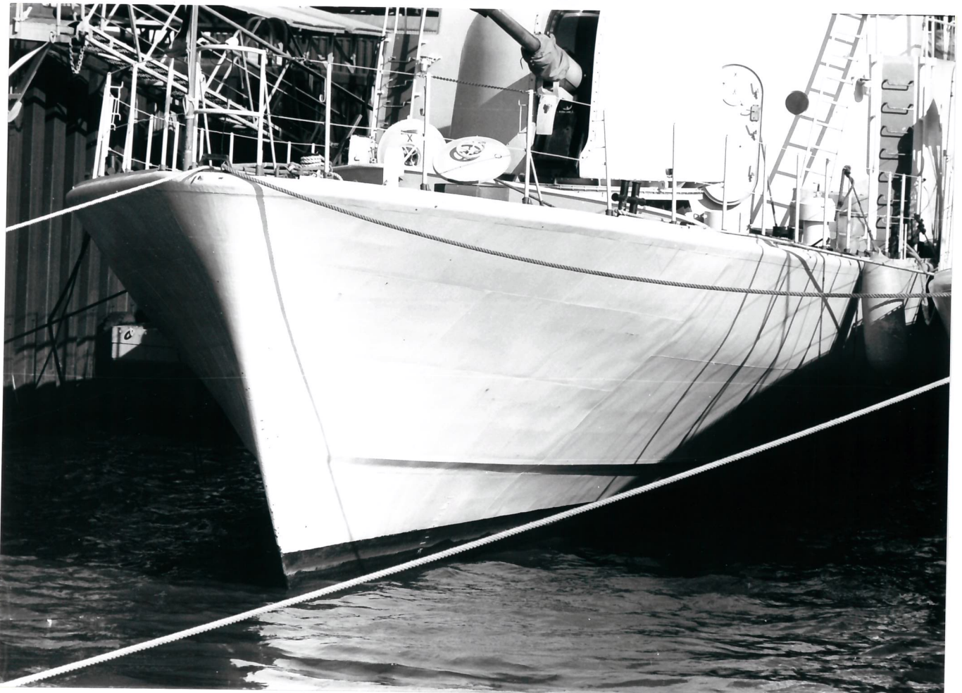
Typ 148 Franzone