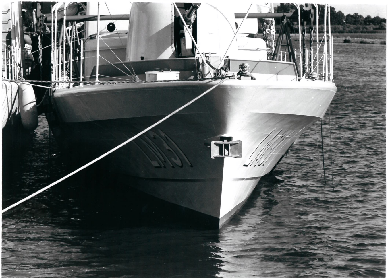
ECU Lürssen TNC 45