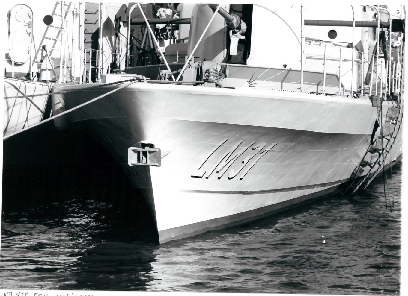
NB. 435 ECU v. Lürssen